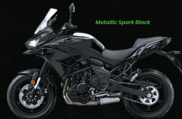
Metallic Spark Black