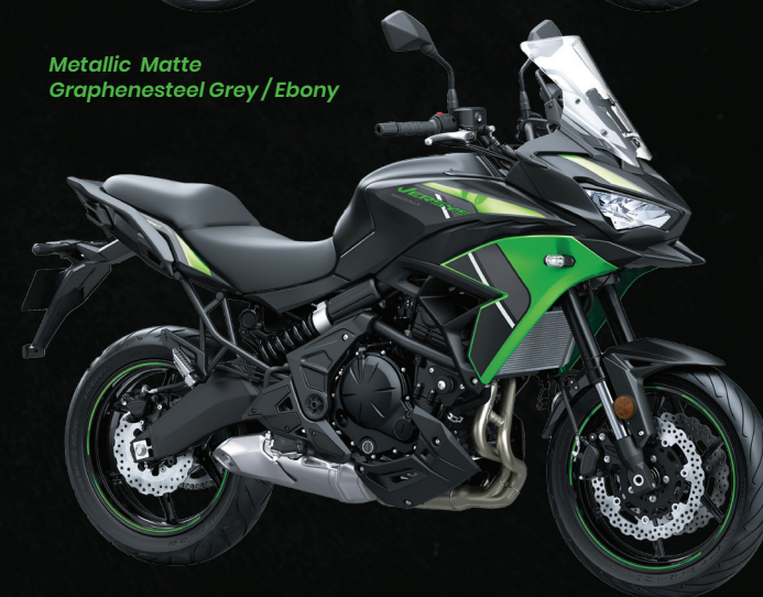
Metallic Matte Graphenesteel Grey / Ebony

* Specifications are subject to change without prior notice